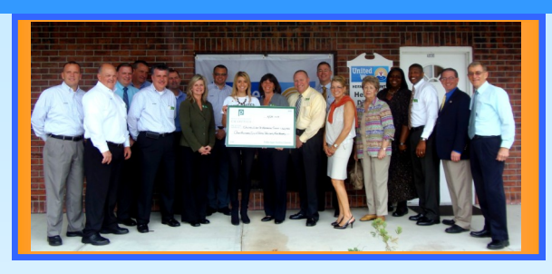
Publix Super Markets Charities & Associates $383,161+ invested in United Way's Community Fund!